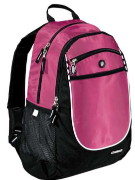
Shades of 674C